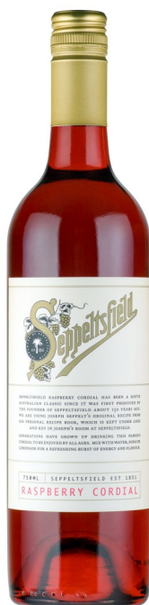
Raspberry Cordial 750 ml