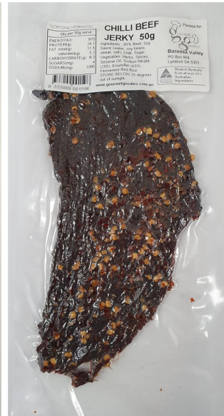
Beef Jerky Chilli 50g