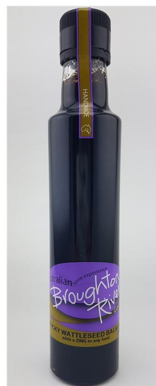
Sticky Wattleseed Balsamic 250ml