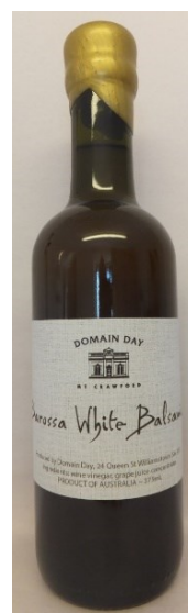
Barossa White Balsamico 375ml