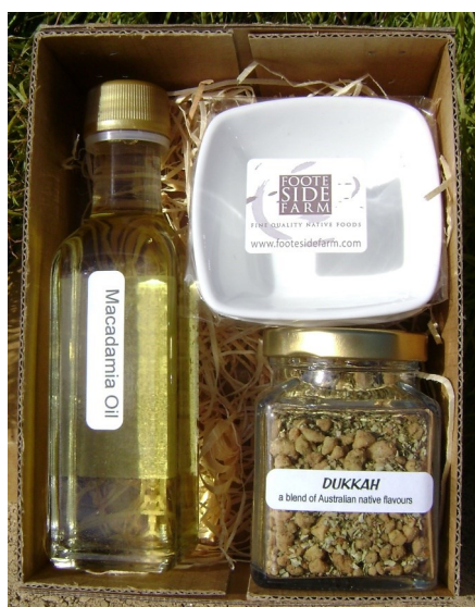
Gift Pack Dukkah 50g Macadamia Oil 100ml 2 China Dishes