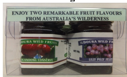
2 x 50g assorted conserve gift boxes