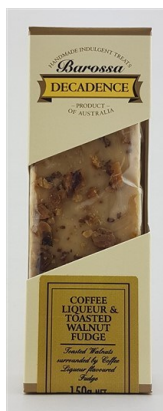
Coffee Liqueur & Toasted Walnut 150g