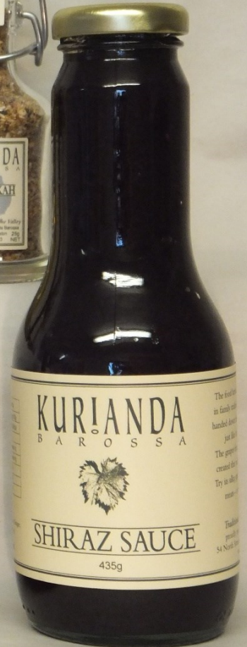
Shiraz Sauce 435g

Bulk Product Available Bush Dukkah 1kg Shiraz Sauce 2.5kg Pear Chutney 2.25kg (not pictured)