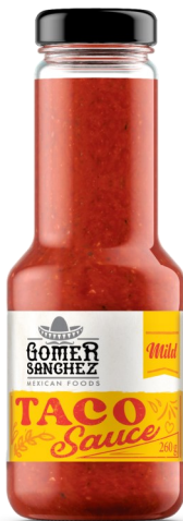
Mild Taco Sauce 260g