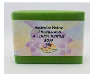
Lemon Grass & Lemon Myrtle Soap 95g

fusionfood a native twist to old favourites