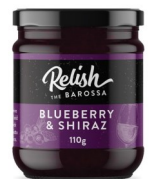
Blueberry & Shiraz Paste 110g