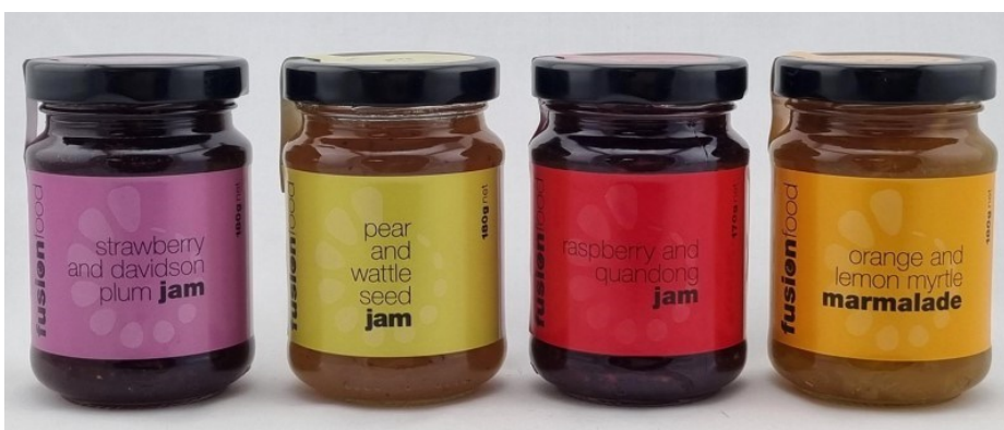
Strawberry & Davidson Plum Jam 170g

fusionfood a native twist to old favourites