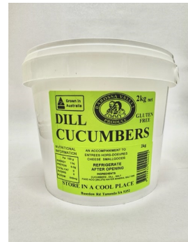
Dill Cucumbers 2kg bucket