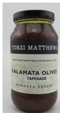
Black Kalamata Olive Tapenade 500g