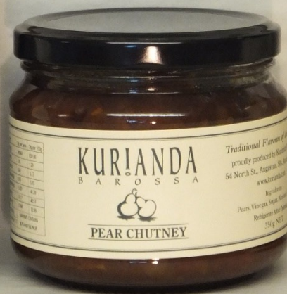
Pear Chutney 350g