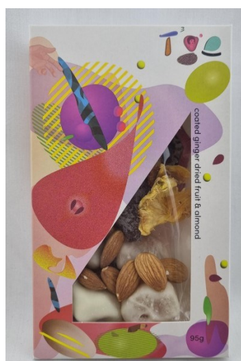
Coated ginger dried fruit & almonds 95g