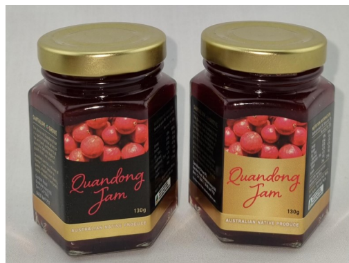
Quandong Jam 130g