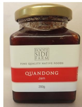
Quandong Jam 200g Seasonal