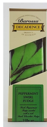
Peppermint Swirl 150g