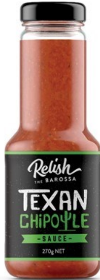
Texan Chipotle Sauce 270g