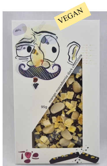
Mango macadamia dark chocolate 95g