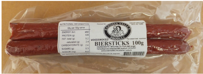
Biersticks, twin pack 100g