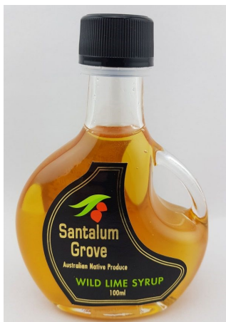
Wild Lime Syrup 150ml