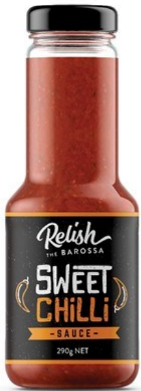
Sweet Chilli Sauce 270g