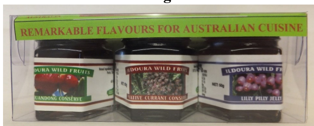
3 x 50g assorted conserve gift boxes