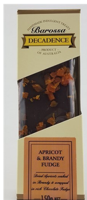
Apricot & Brandy 150g