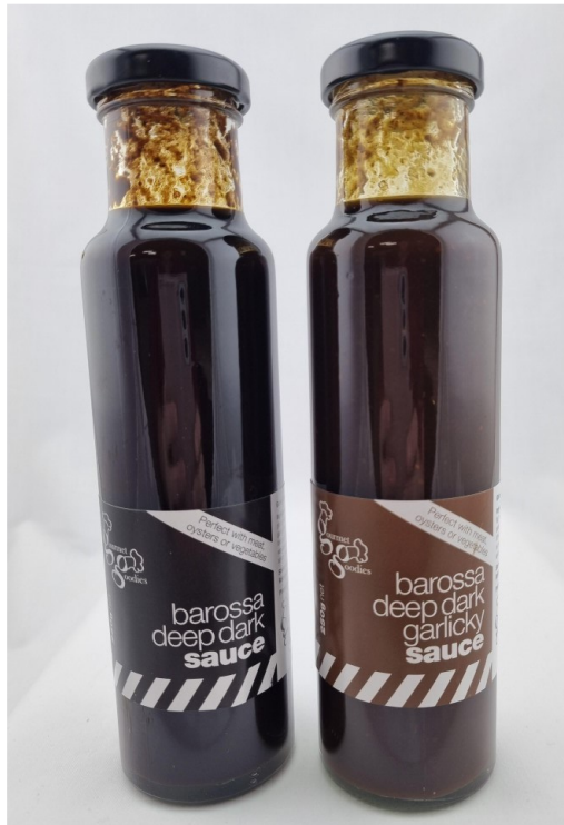
Deep Dark Sauce 250g