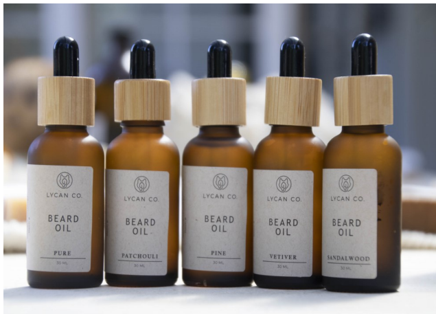
Beard Oil 30g 5 fragrances