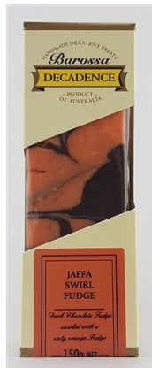
Jaffa Swirl 150g