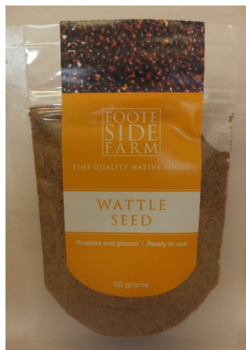
Wattle Seed 60g Available by the kilo