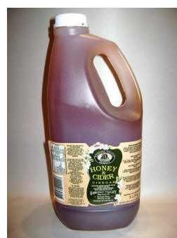
Honey & Cider Vinegar 2ltr