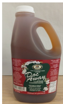
Doc Away Apple & Honey 2ltr