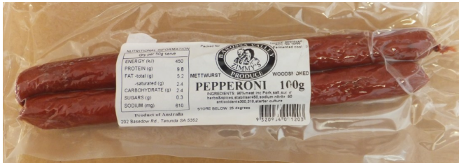
Pepperoni, twin pack 100g