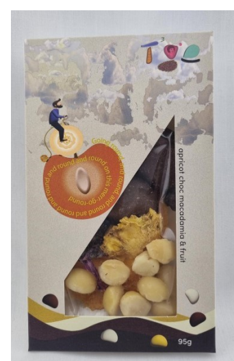
Apricot choc macadamia & fruit 95g