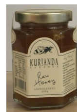
Raw Honey 250g