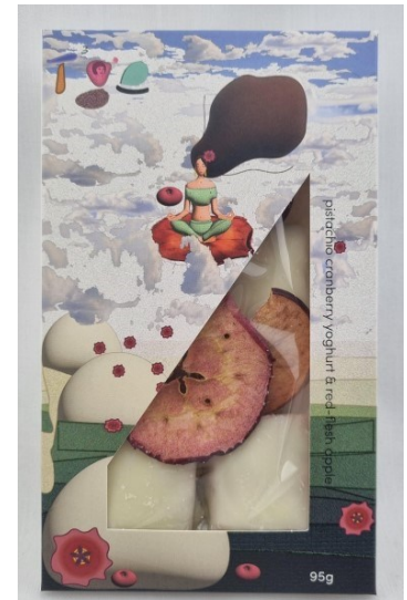
Pistachio cranberry yoghurt & redflesh apple 95g