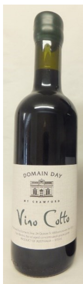
Vino Cotto 375ml