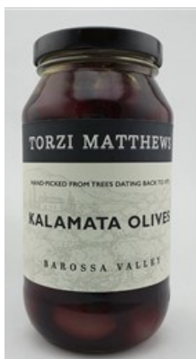
Black Kalamata Olives 500g