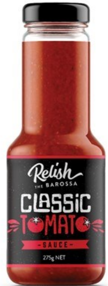
Classic Tomato Sauce 275g