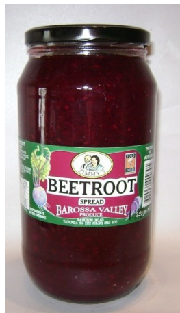
Beetroot Spread 1.1kg