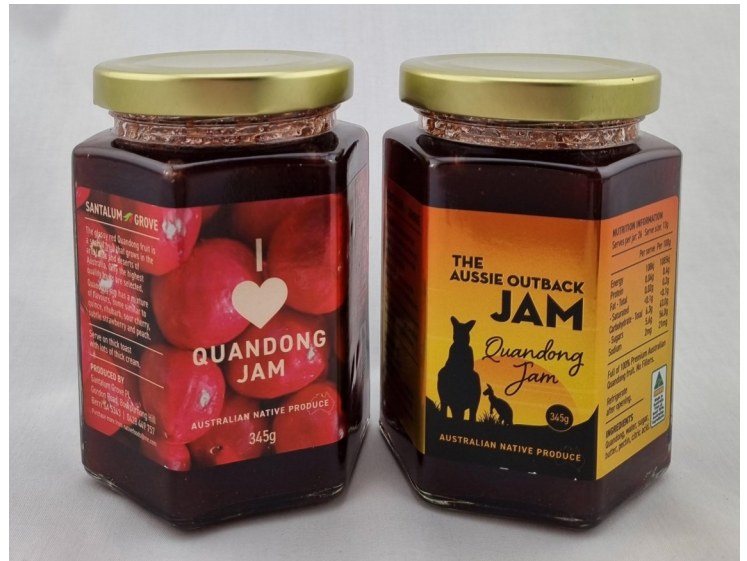
Quandong Jam 345g