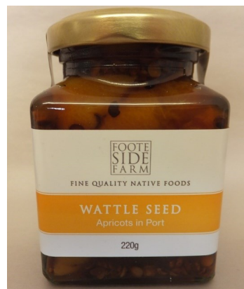
Wattle Seed Apricots in Port 200ml