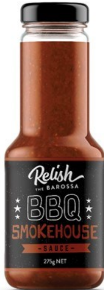
BBQ Smokehouse Sauce 275g