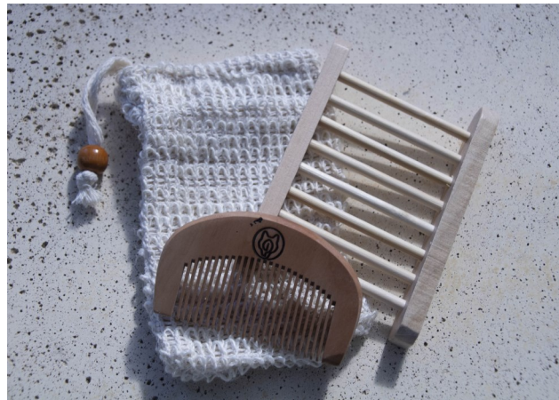
Soap Net Saver Beard Comb