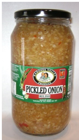
Pickled Onion Relish 1.1kg