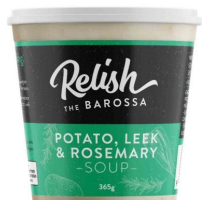
Potato, Leek & Rosemary 365g