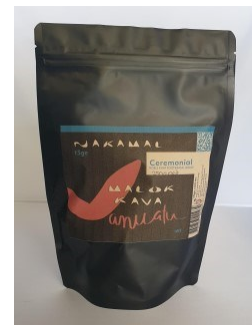
Nakamal Malok Ceremonial Kava (Standard) 250g