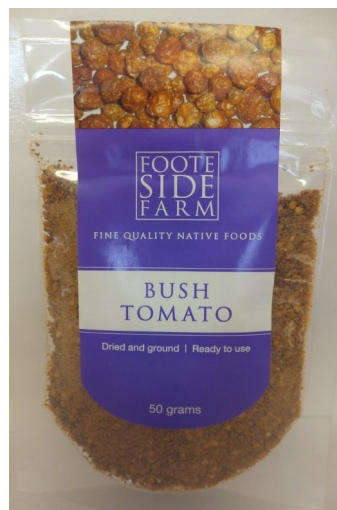
Bush Tomato 50g