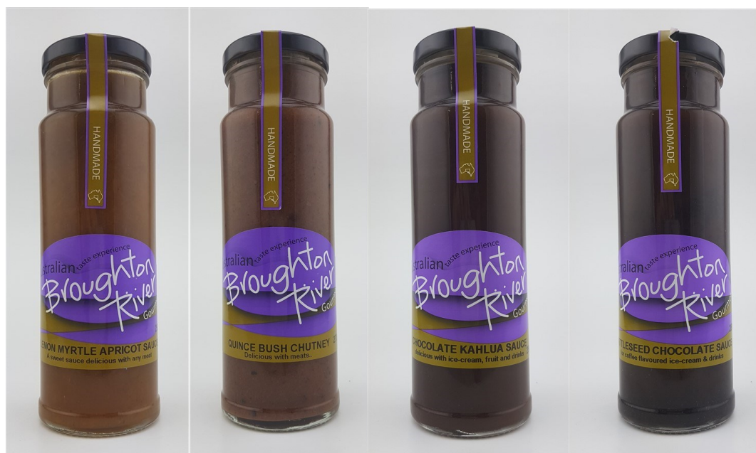
Lemon Myrtle Apricot Sauce