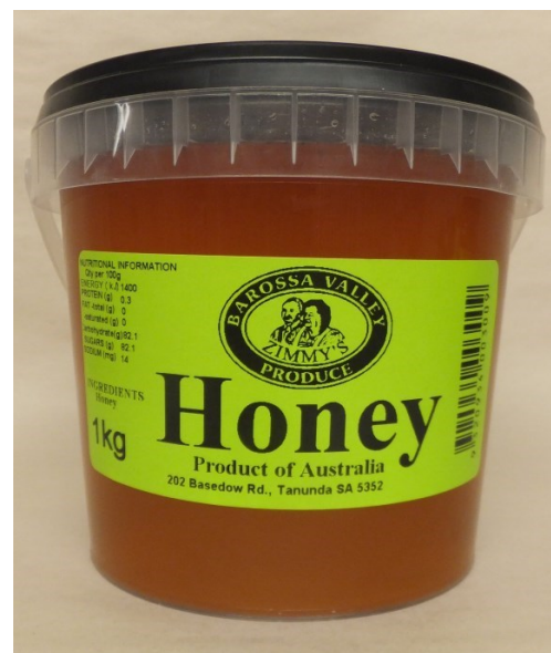
Honey 1kg tub