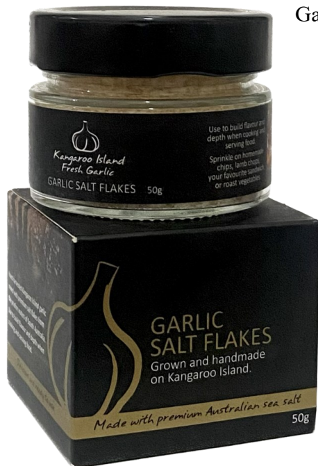
Garlic Salt 50g