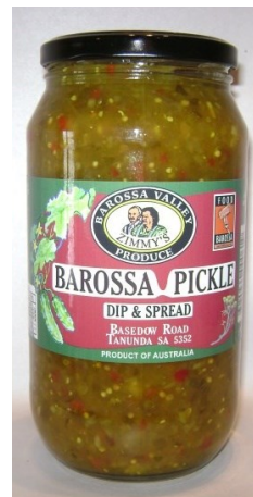
Barossa Pickle 1.1kg