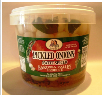
Pickled Onions 2.5kg bucket