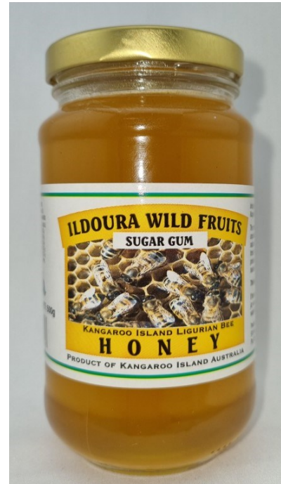
Honey (Sugar Gum) 500g