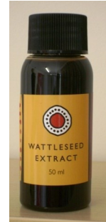
Wattleseed Extract 50ml