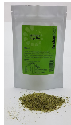
Lemon Myrtle 30g