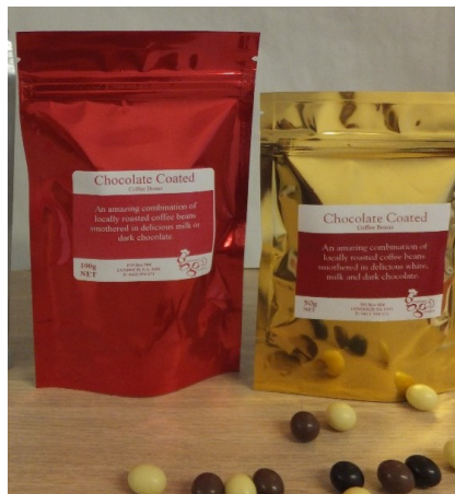
Chocolate Covered Coffee Beans 100g & 50g