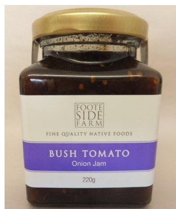
Bush Tomato Onion Jam 200g