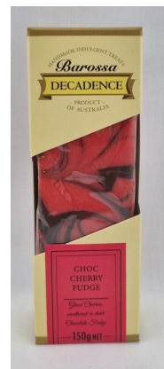
Choc Cherry 150g