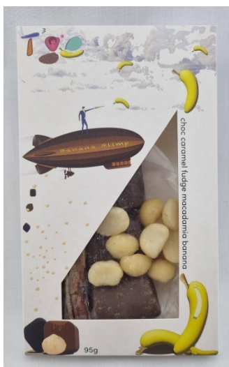
Choc caramel fudge macadamia banana 95g