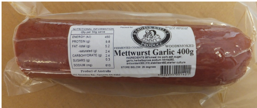
Garlic Mettwurst 400g

Red Wine & Cracked Pepper Mettwurst 400g available