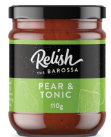
Pear & Tonic Paste 110g