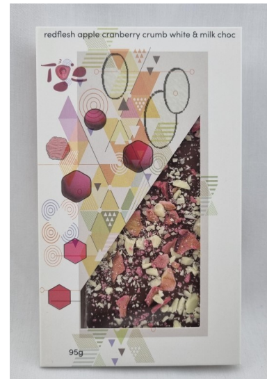
Redflesh apple cranberry crumb white & milk choc 95g