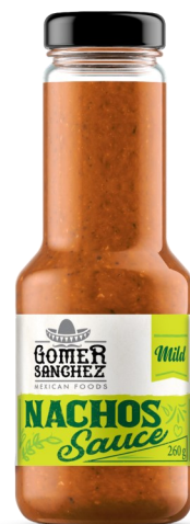
Mild Nacho Sauce 260g