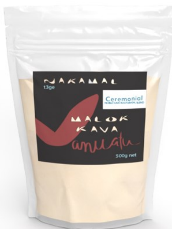
Nakamal Malok Ceremonial Kava (Standard) 500g