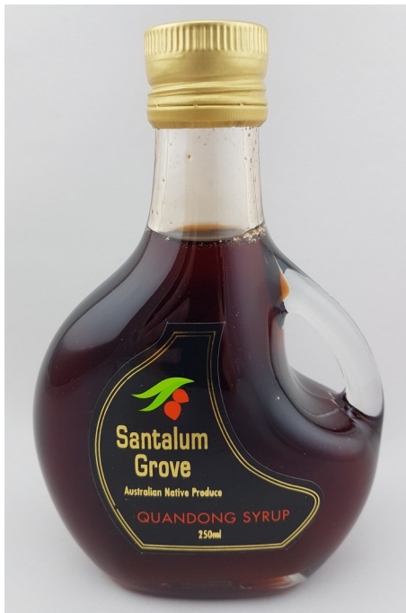
Quandong Syrup 250ml