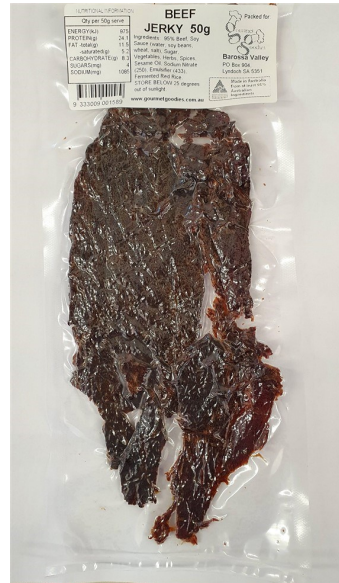
Beef Jerky 50g