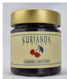
Cherry Chutney 250g