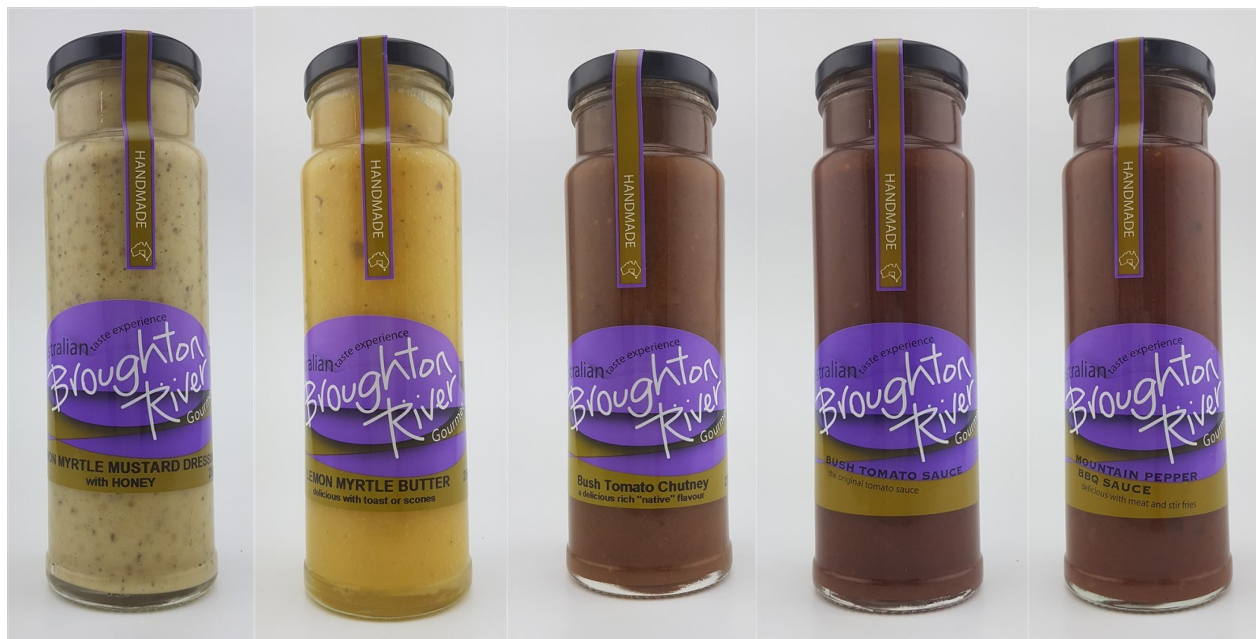
Lemon Myrtle & Mustard Dressing 225ml