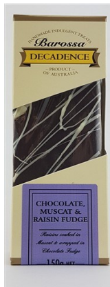
Chocolate Muscat & Raisin 150g