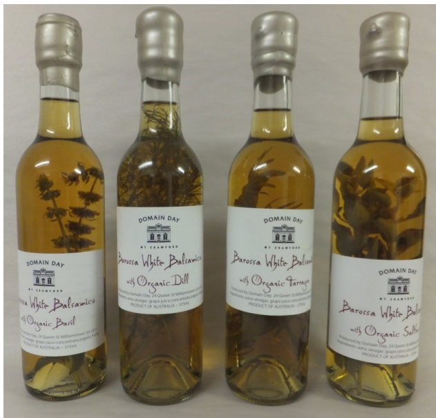
Barossa White Balsamico 375ml with Organic Basil Organic Dill Organic Tarragon Organic Salt Bush