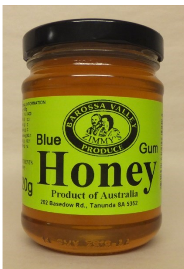
Honey 320g jar

Red Wine & Cracked Pepper Mettwurst 400g available