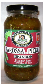
Barossa Pickle 500g