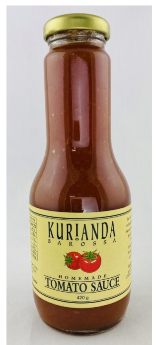
Homemade Tomato Sauce 420g