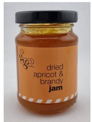
Dried Apricot Jam 170g