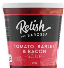
Tomato, Barley & Bacon 365g