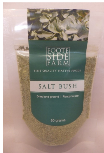
Saltbush 50g Available by the kilo