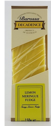
Lemon Meringue 150g