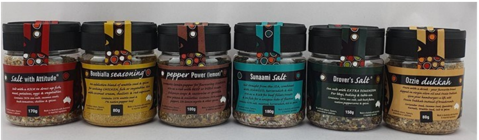
Salt with Attitude 170g pet shaker