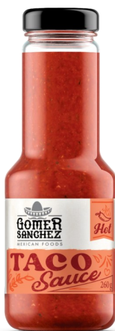
Hot Taco Sauce 260g