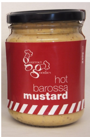
Hot Barossa Mustard 240g