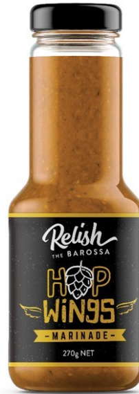
Hop Wings Marinade 270g