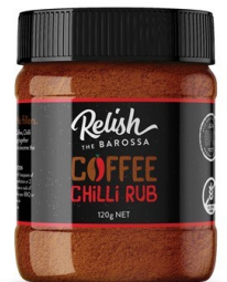
Coffee Chilli Rub 120g