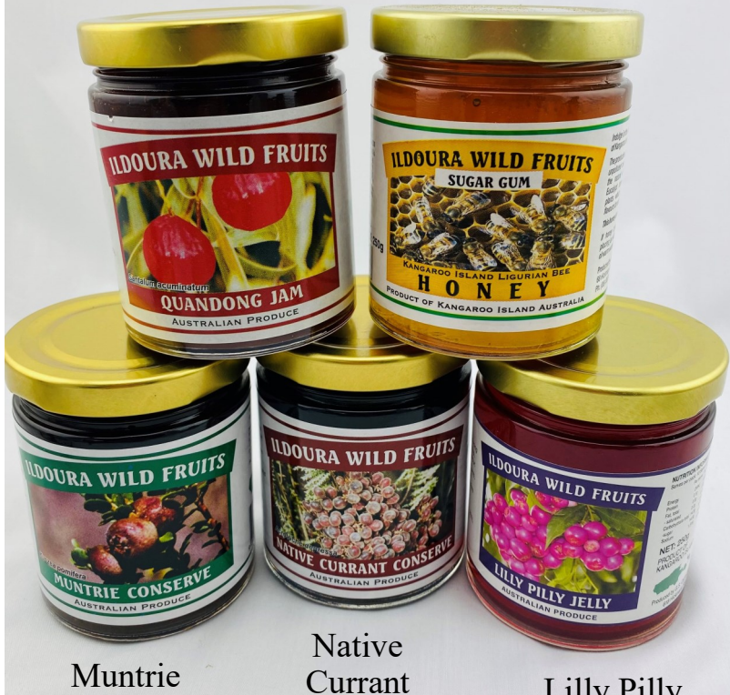
Muntie Conserve 250g