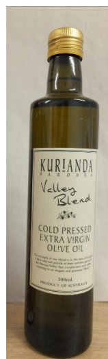
"The Blend" Extra Virgin Olive Oil 500ml