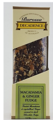
Macadamia & Ginger 150g