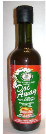
Doc Away Apple & Honey 375ml