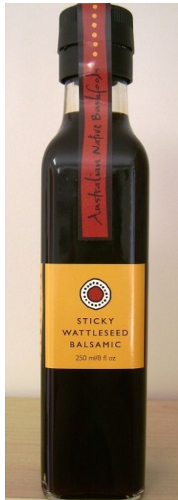
Sticky Wattleseed Balsamic 250ml