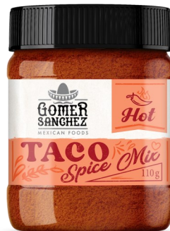
Hot Taco Spice Mix 110g