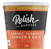
Carrot, Turmeric, Ginger & Kale 365g