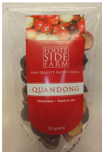
Quandong 50g Seasonal