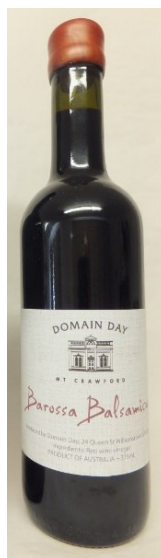
Barossa Balsamico 375ml