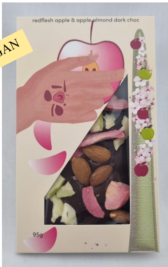
Redflesh apple & green apple almond dark choc 95g