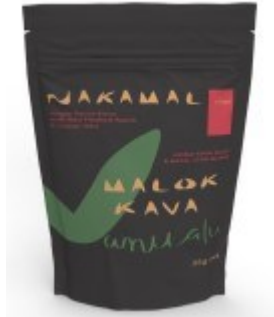
Nakamal Malok Ceremonial Kava (Standard) 250g