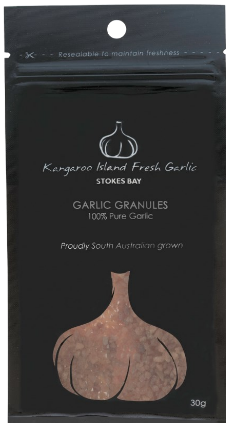
Garlic Granules 30g