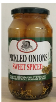
Pickled Onions Sweet Spiced and Chilli 500g