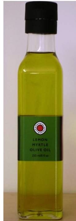
Lemon Myrtle Olive Oil 250ml