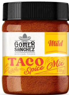
Mild Taco Spice Mix 110g