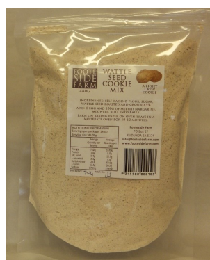
Wattle Seed Cookie Mix 480g