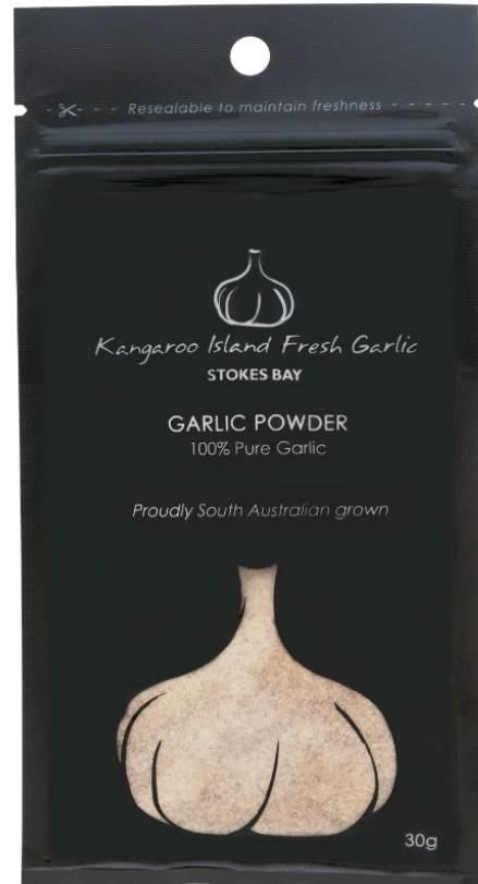
Garlic Powder 30g