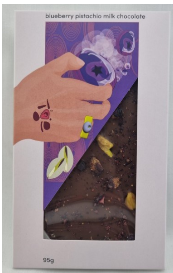
Blueberry pistachio milk chocolate 95g