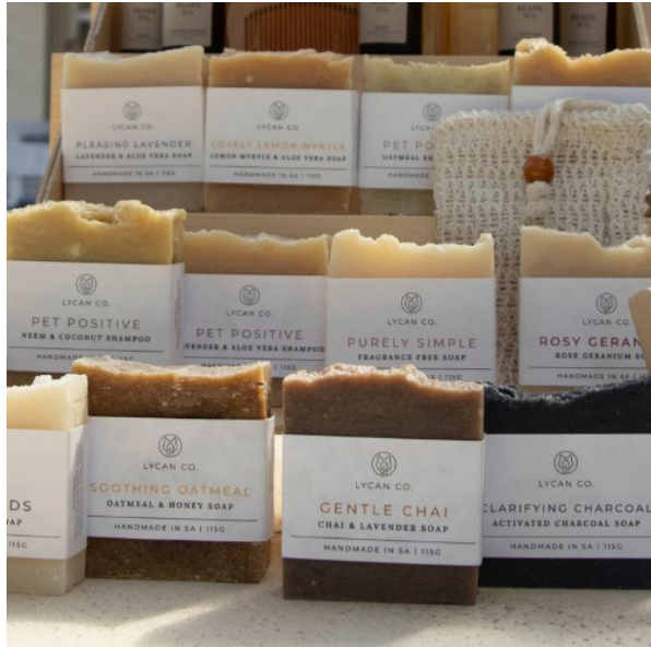
Soap Bars 115g 11 fragrances