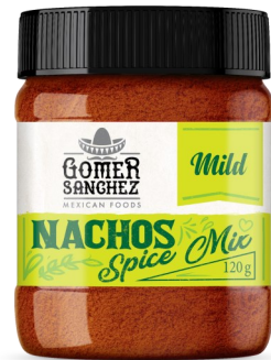
Mild Nachos Spice Mix 120g