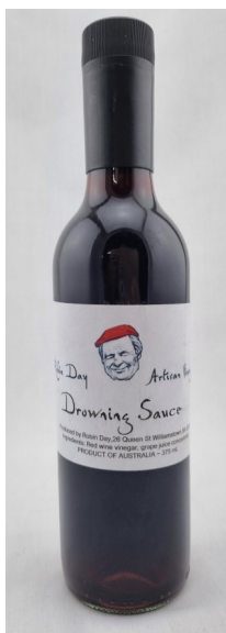
Drowning Sauce 375ml