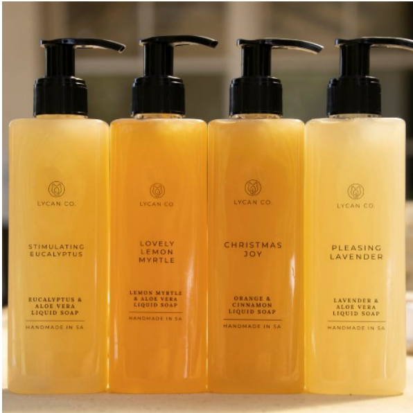
Liquid Soaps 240ml 5 fragrances