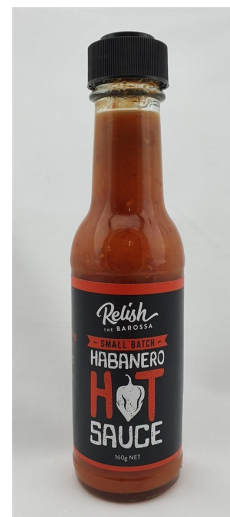
Habanero Hot Sauce 160g